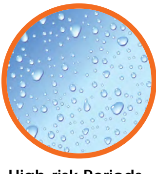
High-risk Periods of Bacterial Growth

Solution for preventing and treating bacterial strains present on equipment or disposable materials, ensuring doses are produced under sterile conditions until the infection source is found and eliminated.