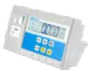
AE 503 Indicator