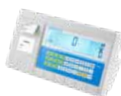
AE 504 Indicator